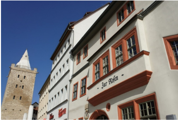
Zur Rosen – House for Young Researchers