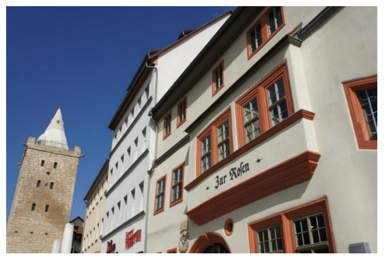
Zur Rosen – House for Young Researchers